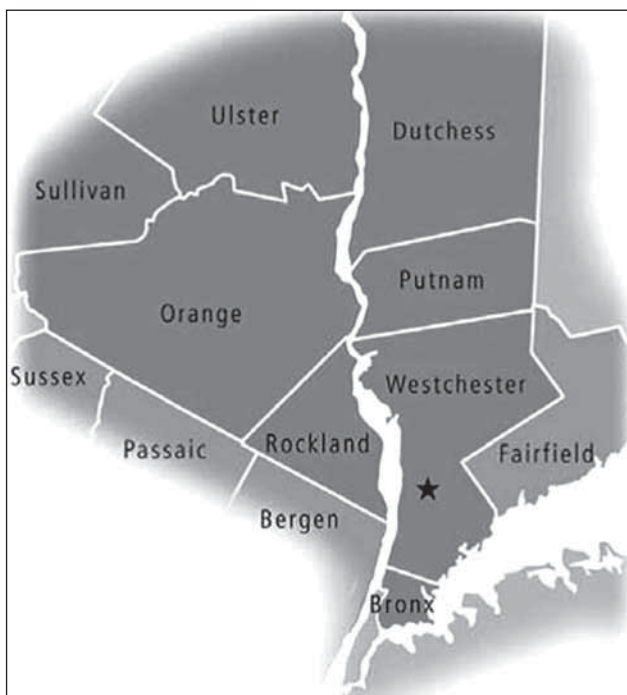
FIGURE 1. Map of the Lower Hudson Valley of New York, USA. Westchester, Putnam, and Dutchess Counties are east of the Hudson River, and Orange, Rockland, Ulster and Sullivan Counties are west of the Hudson River. The star indicates the site of the Westchester Medical Center. Permission for use of this image granted from the Westchester Institute for Human Development on July 23, 2010.

Although the number of babesiosis cases increased on both sides of the river, 104 (87.4%) of 119 reported cases in 2008 occurred in residents of counties east of the Hudson River (Table 1). The 104 cases in the 3 counties east of the Hudson River, with a total population of 1,346,065 (6), corresponds to 7.7 cases per 100,000 residents, compared with 15 cases among a total population of 936,051 or 1.6